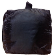
Optional Sand Bag