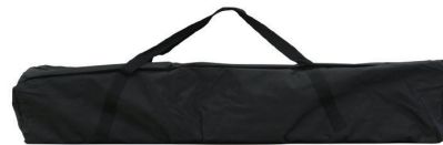
Nylon Travel Bag