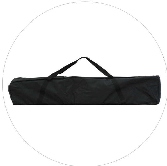
(qty 1) Travel Bag