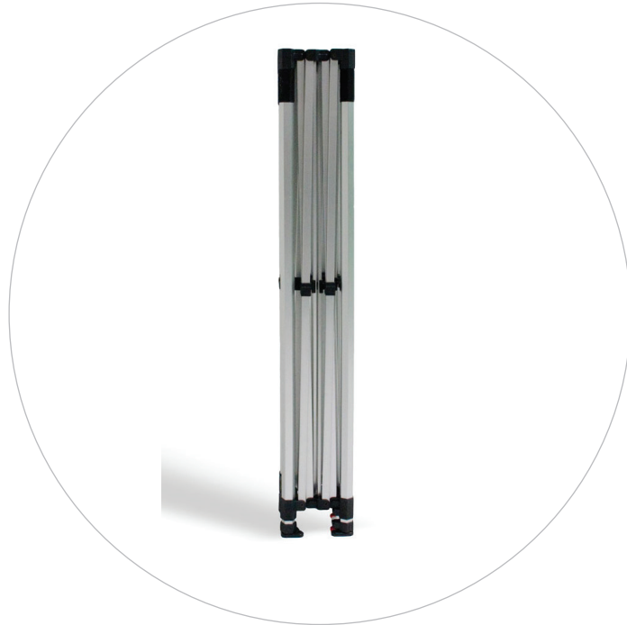
(qty 1) Canopy Frame